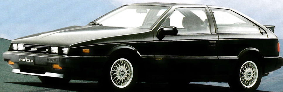
PIAZZA handling by LOTUS (対米輸出仕様車・現地名IMPULSE)