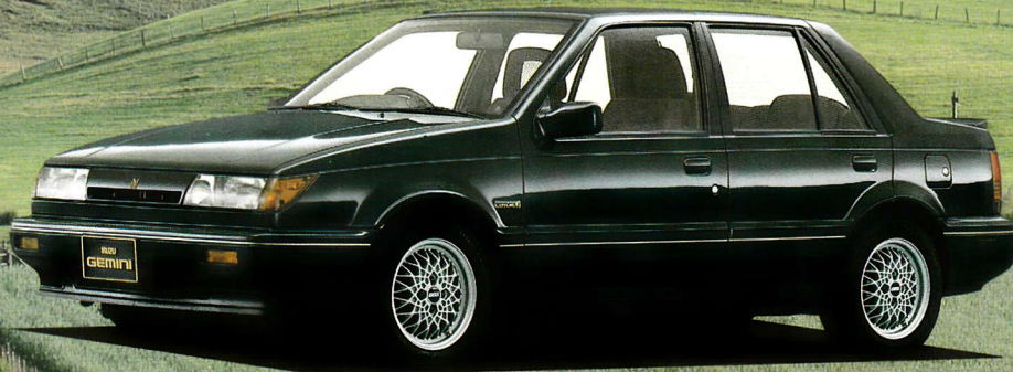
GEMINI DOHC handling by LOTUS (参考出品車)